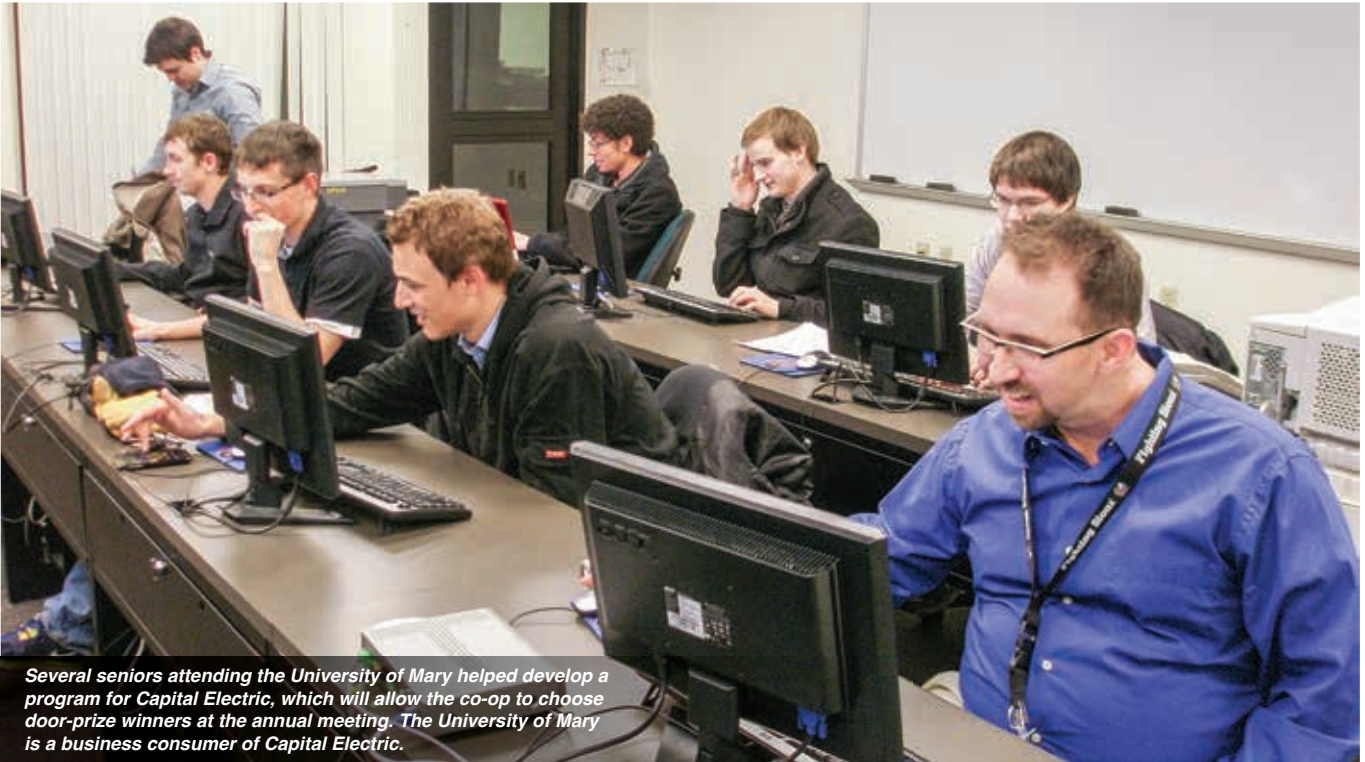
Several seniors attending the University of Mary helped develop a program for Capital Electric, which will allow the co-op to choose door-prize winners at the annual meeting. The University of Mary is a business consumer of Capital Electric.