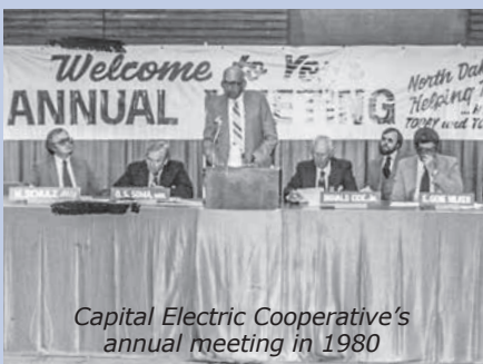
Capital Electric Cooperative's annual meeting in 1980

Capital Electric's 68th annual meeting will be held June 3 at the Ramkota Hotel in Bismarck. We hope to see you there!