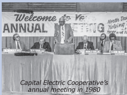
Capital Electric Cooperative's annual meeting in 1980

Capital Electric's 68th annual meeting will be held June 3 at the Ramkota Hotel in Bismarck. We hope to see you there!