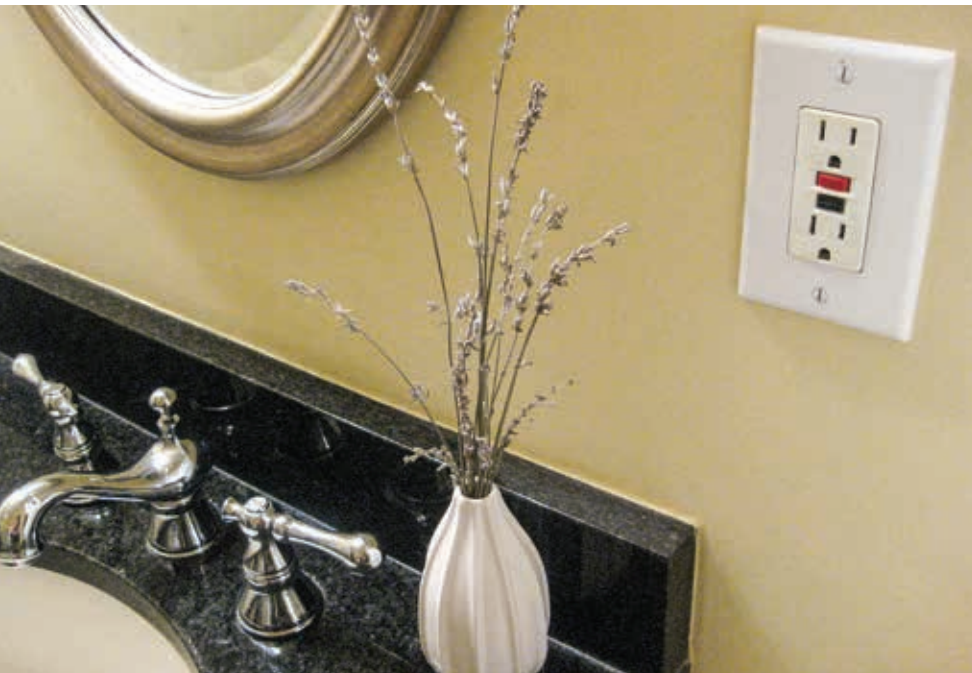
A GFCI should be used in any area where water may come into contact with electrical products, such as the bathroom, kitchen or outdoors.

The statistics are staggering. Electrical failures or malfunctions were factors in an estimated 47,700 home fires in 2011, according to the National Fire Protection Association. And fire is not the only danger. Thousands of children and adults are critically injured and electrocuted annually from electrical hazards in their own homes.