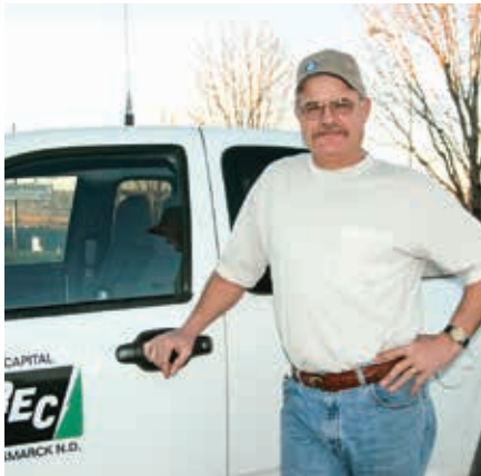
He has driven thousands of miles in his work truck, known as 82, reading and repairing meters across the Capital Electric Cooperative service area.